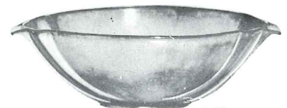
4.75 *201—9" BOWL