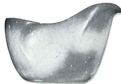
4A—8 OZ. CREAMER 3.25