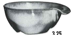
3.25 *4X—14 OZ. CEREAL