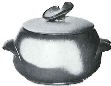
9.25 *4V—2 QT. BAKER/BEAN POT 16.50 *4V/W—BAKER/W WARMER SET