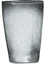
*5L—12 OZ. TUMBLER 3.75