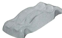
*249 TACO HOLDER BOXED 2 PER BOX 10.00 Not Available in Flame