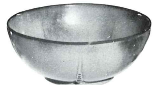
*224—8" ROUND BOWL 6.50