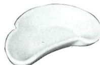
*243—6½" CRESCENT SALAD 2.50