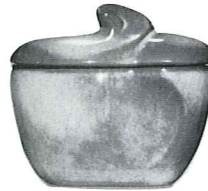
4B—SUGAR WITH LID 5.00