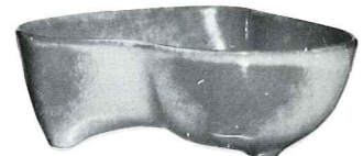
*4N—24 OZ. VEGETABLE 4.75