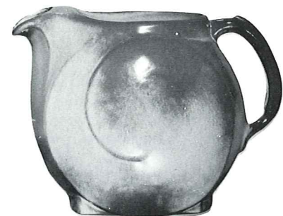
*4D—2 QT. PITCHER 9.25

THIS PAGE AVAILABLE IN PRAIRIE GREEN, DESERT GOLD, BROWN SATIN, COFFEE BROWN & ROBIN EGG BLUE, EXCEPT WHERE NOTED*