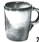
2.75 *5CC—5 OZ. TEACUP