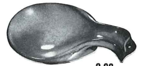
3.00 *4Y—6" SPOON HOLDER